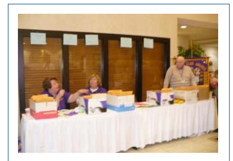
Winter Conference Registration 2008

Also, did you know that July 1987 marked the 20 th Anniversary of Women Lions ? And did you know that women are the fastest growing group of Lions? According to the Lions' International website women make up "nearly 20% of all members and taking on numerous leadership roles within the association, including 30.5% of council chairpersons.