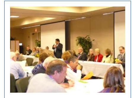
Winter Conference Luncheon 2008

The transition officially happens at 2:00 AM (local standard time), which becomes 3:00 AM local daylight time.