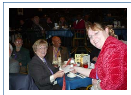
Winter Conf.: Winner of Friday night's 50/50 drawing